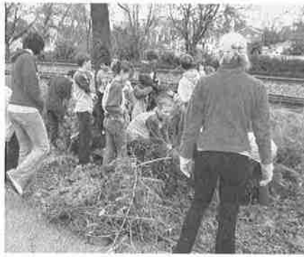
St. Petronille teachers and Glen Ellyn Public Works employees overseeing Arbor Day planting.