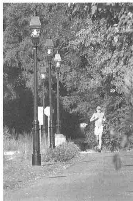
Jogger travels over new section of asphalt Path adjacent to the Montclair parking lot in Glen Ellyn. Three new lampposts are on the left. If you look closely, you can spot The IPPc trash container next to one of the lampposts.

Trees for Trails c/o The Illinois Prairie Path P.O. Box 1573 Wheaton, IL 60187