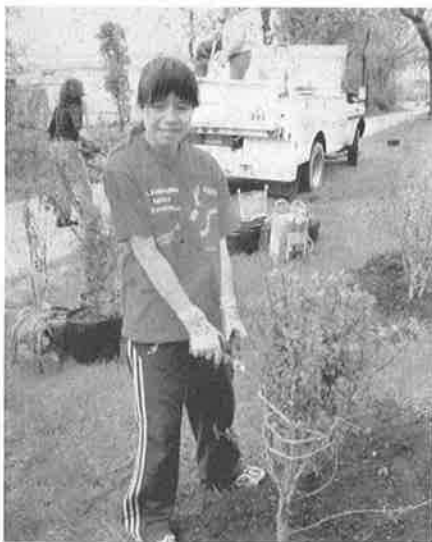
St. Petronille student prepares to cut twine protecting branches of newly-planted shrub on Illinois Prairie Path in Glen Ellyn for Arbor Day celebration, May 14, 2008. Village public works crew and truck in background.