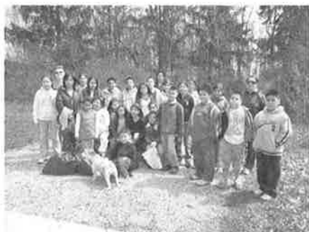
St. Andrews/San Andres— a job well done.

cleanup efforts like those in Wheaton and Glen Ellyn have done this for years, and we've learned from their example. It is satisfying that the folks in Winfield are doing more and more to clean up the IPP, public spaces, and forest preserve spaces that we all value. The best part for me was being able to work with the extraordinary people who have a well-developed feeling of community and are willing to donate a few hours of their time for a worthy cause. It was amazing what we got done on a Saturday morning, and I hope that next year you'll join us!