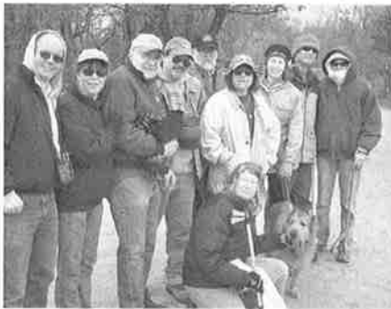
Some of the Winfield volunteers bundled up against the cold

at the corner of County Farm and Geneva Roads. Cold winds notwithstanding, we broke up into groups to scour Winfield Road, the nearby Timber Ridge Forest Preserve and Timber Lake, and the trail from the Elgin Branch to the Great Western Trail. Within minutes we had all started working, which also helped us keep moving (and warm) against the cold.