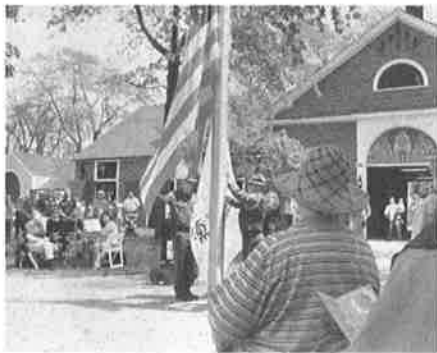
Flag-raising at Open House at St. James Farm May 24, 2008, in front of the red brick barn.

equestrian facilities. They then used them, by means of a steeplechase race, to benefit various charitable organizations, such as St. James Riding School for the Handicapped and Marianjoy Rehabilitation Hospital.