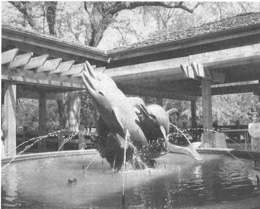
Dolphin fountain in pavilion near former jump course, judging tower, and caboose.