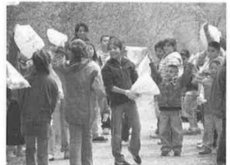
Cleanup in action!

Our last and perhaps most enthusiastic group was the bilingual Saturday class from the St. Andrews/San Andres Lutheran Church Sunday School. I assigned this group the Geneva Spur from Winfield Road to Prince Crossing. Over thirty students and their adult chaperones formed a cleanup wave that descended on the Geneva Spur. Each student brought their own grocery garbage bag, and everyone raced to pick up the most. The Geneva Spur has likely never been cleaned so well in its long history. Plus, there is nothing as wonderful as all those bright and shining faces bringing cheer to the IPP; they got good exercise, supported a terrific cause, enjoyed a scenic area (one of my personal favorites) and got to know the IPP.