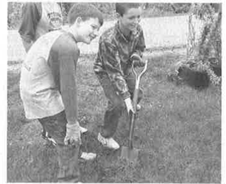
St. Petronille students, assisted by Glen Ellyn Public Works employees, dig holes to plant shrubs on Illinois Prairie Path to celebrate Arbor Day, May 14, 2008.

and four American Plum—and the following shrubs—eight American Filbert, eight Blackhaw Viburnum, six Nannyberry Viburnum, fourteen Red Chokeberry, and six Ninebark. Besides planting the trees and shrubs, they also pulled up bushels of garlic mustard, which had crowded out most of the native prairie plants that formerly grew there.